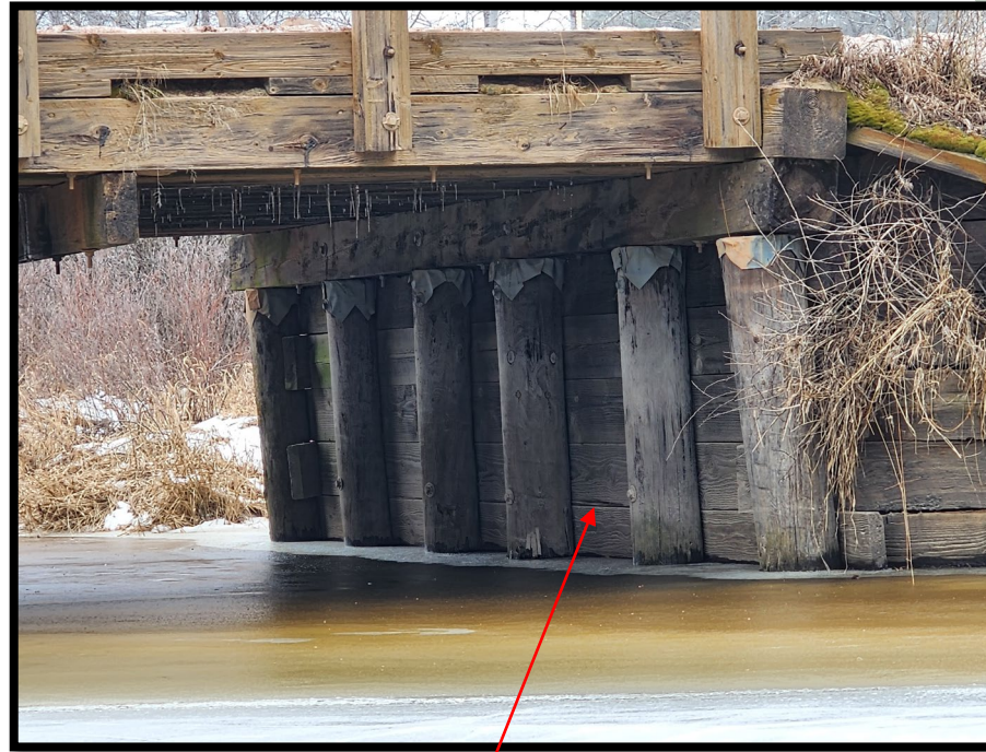
Cracking in timber abutments