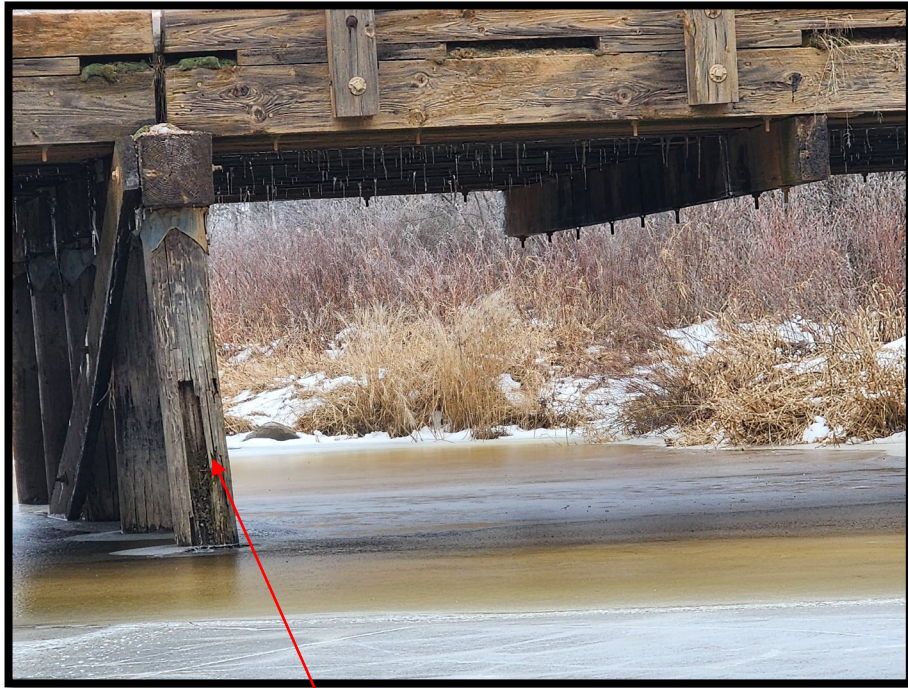
Decaying timber piles